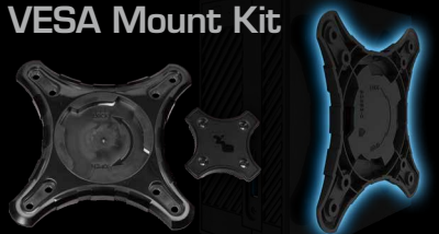
VESA Mount Kit