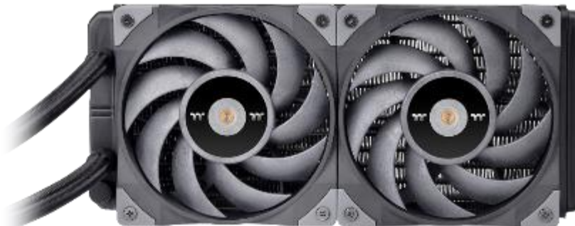
Powerful Cooling Fan