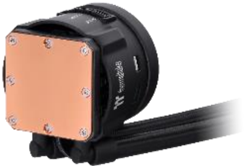
High Performance Water Block