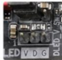
Digital Pin Header