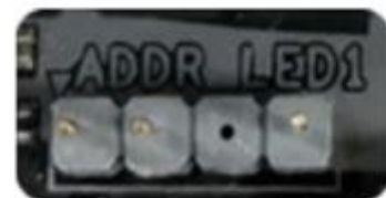
Addressable RGB LED Header