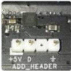
Aura Addressable Header