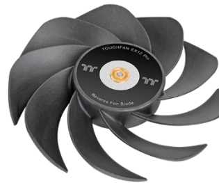
Unique Fan blade shape