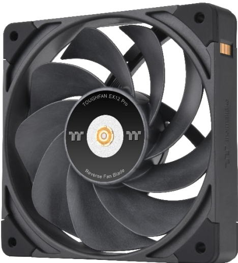
Reverse Fan Blade