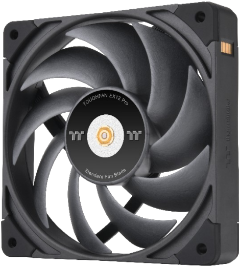
Standard Fan Blade