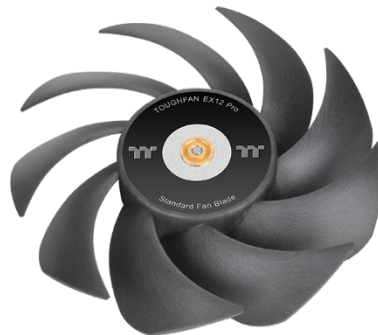
Standard Fan Blade