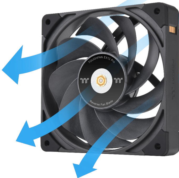
Reverse Fan Blade