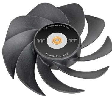
Reverse Fan Blade