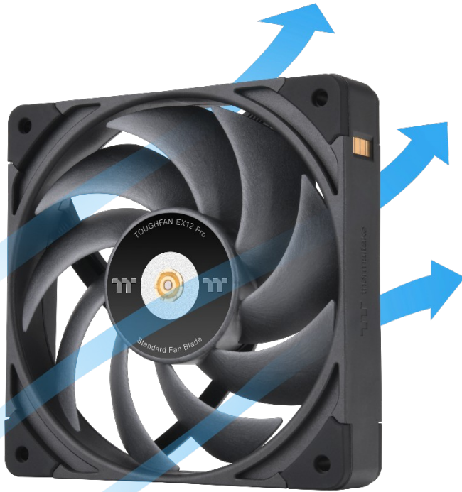
Standard Fan Blade